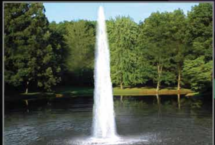
Floating Foaming Jet - 18m ht, 20hp