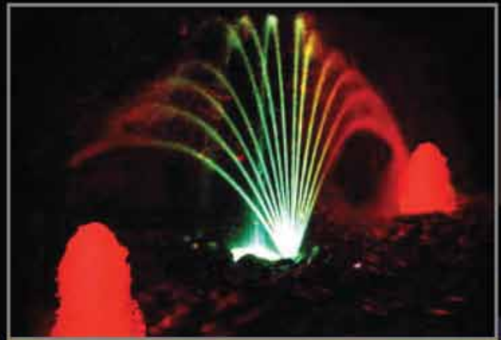
Peacock Tail with Foam Cluster - 3.5m max ht, 9 x 2.5m dia, 10hp