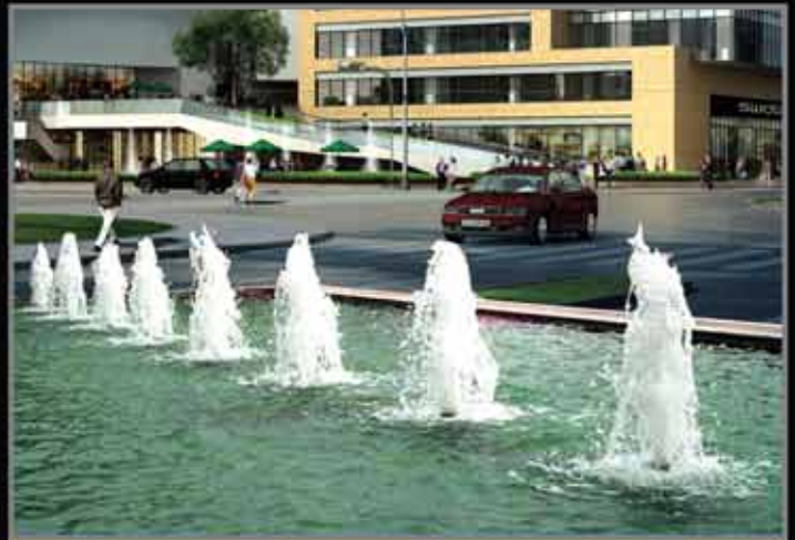
Foam Bubbler Line - 0.75m ht, 7.6 x 2.4m wide, 7.5hp