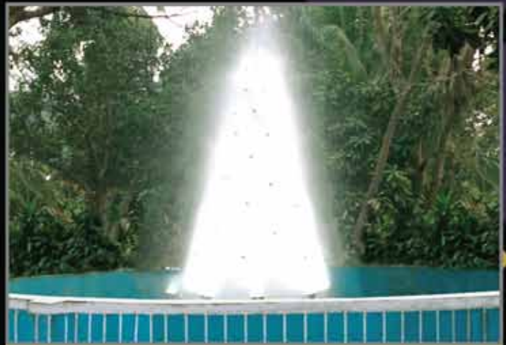
Pine Tree - 3.6m ht, 6m dia, 7.5hp