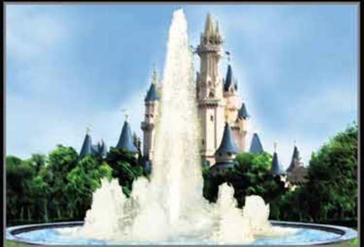
Orlando - 3m max ht, 3.5m dia, 10hp