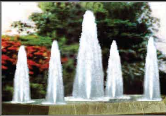
Multiple Cascade - 3.5m max ht, 7m dia, 10hp