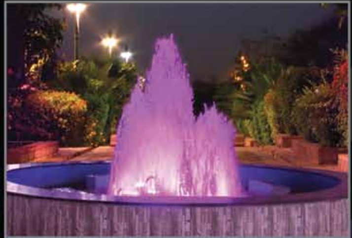
Mini Santa Maria - 1.5m ht, 3.65m dia, 3hp