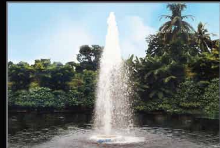
Foaming Jet - 6m ht, 3hp