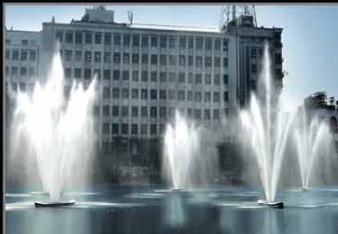
Floating High & Heavy Cascade - 13m ht, 20hp