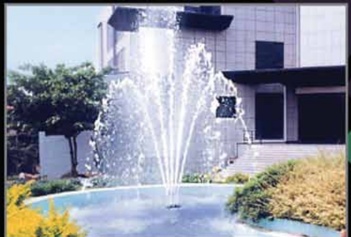
Cascade Jet - 4.5m ht, 6m dia, 10hp