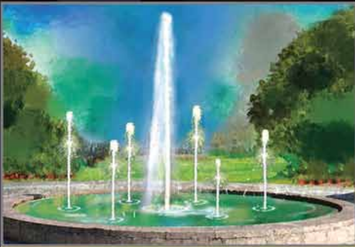
Jumping Around the Column - 5.5m max ht, 9m dia, 10hp