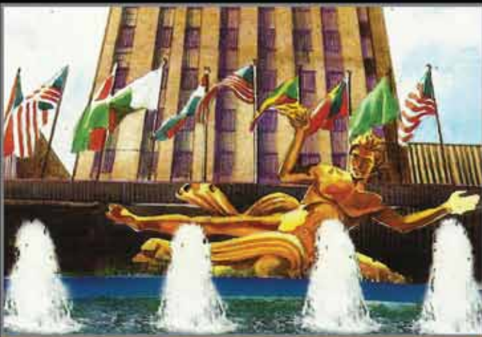
Fifth Avenue - 1m ht, 6m x 2m dia, 5hp