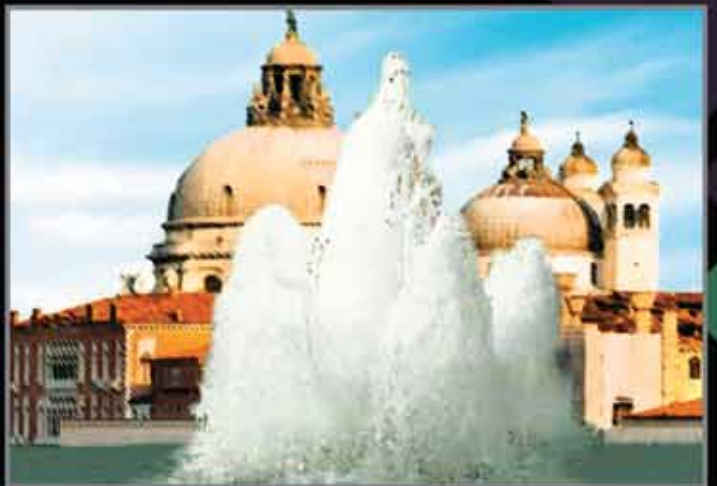
Santa Maria - 2.2m max ht, 6m dia, 10hp