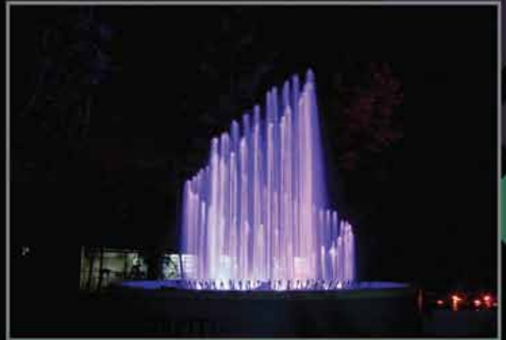
Tubular Motion - 3m ht, 4.5m dia, 10hp