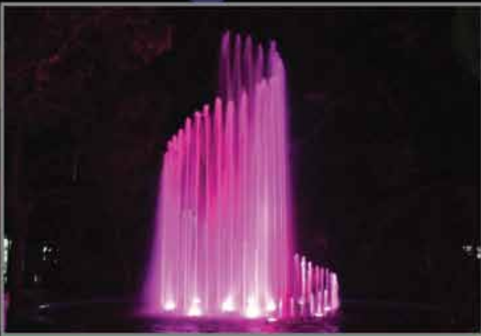
Spiral - 4.5m ht, 6m dia, 10hp