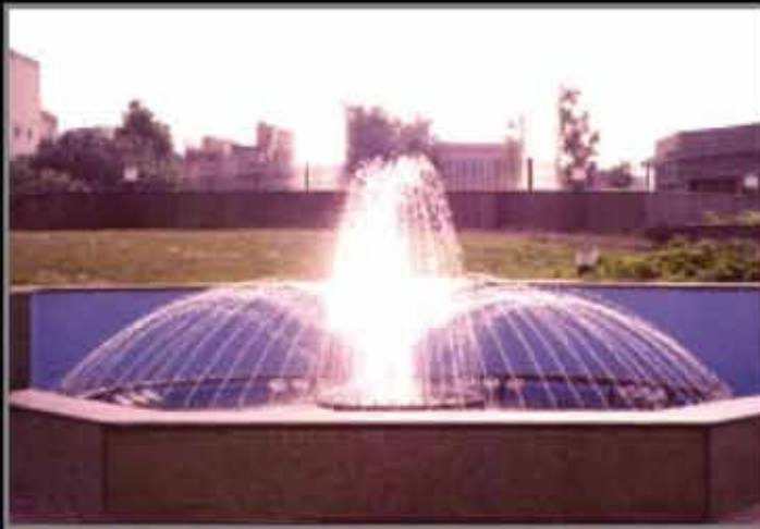
Double Dome - 2.5m ht, 7m dia, 10hp