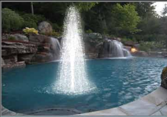
Cascade Jet - 5.5m ht