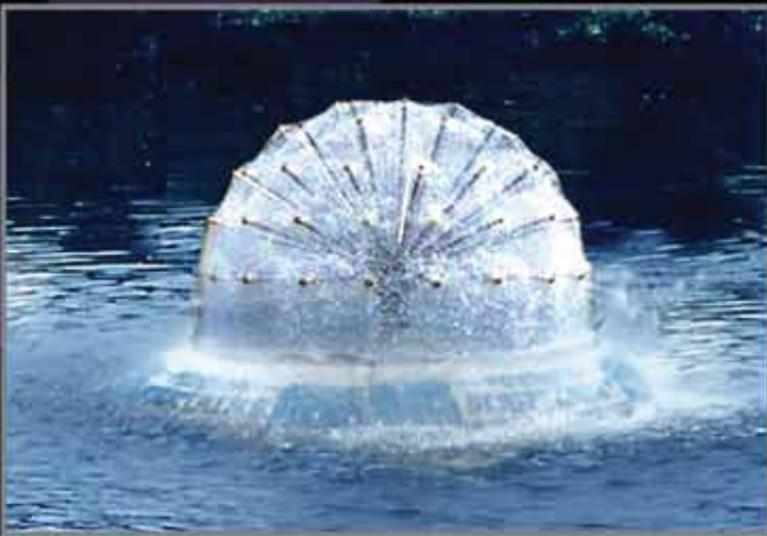
Half Dandelion - 1.6m dia, 3hp