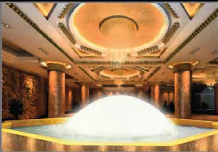
Kyoto (for indoors only) - 6.5m dia, 7.5hp, 4.5m ht