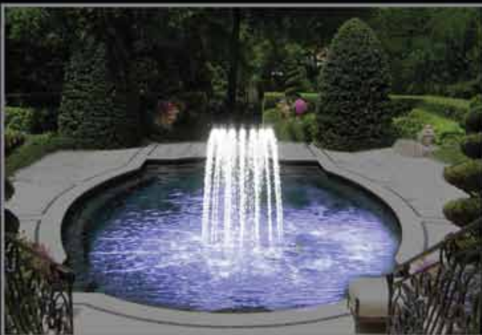
Inside Drop-2m ht