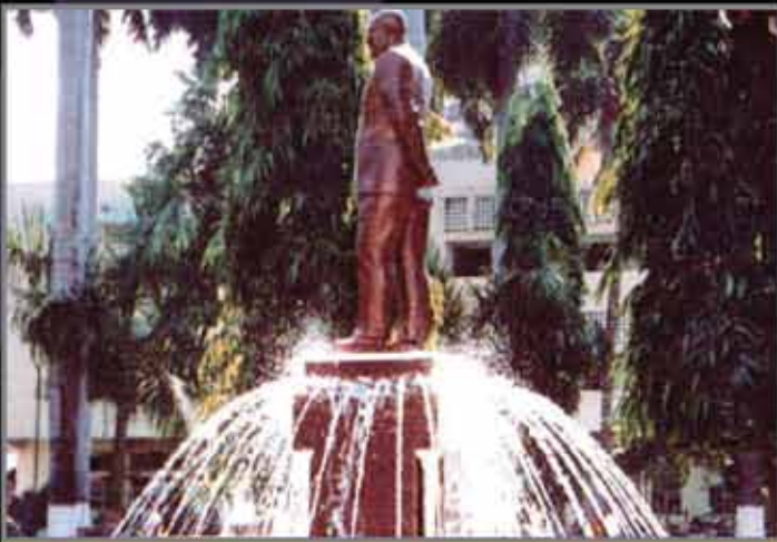
Ring Fountain - 3m ht, 7m dia, 10hp