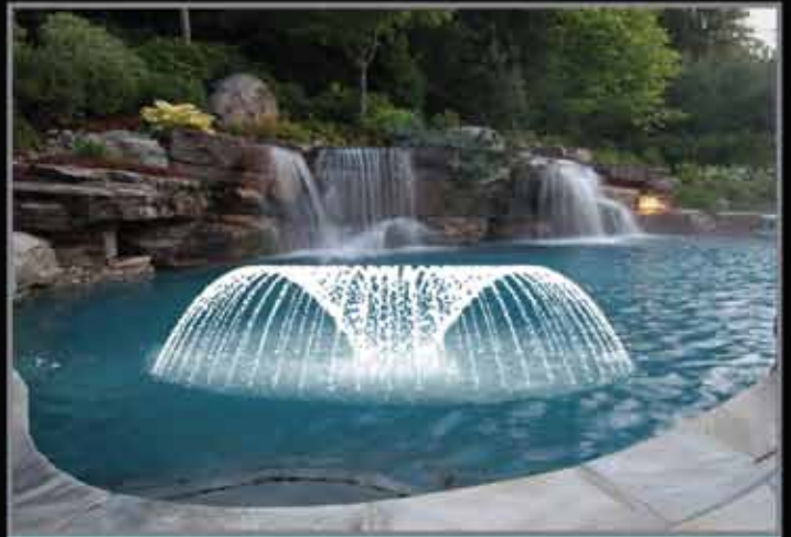
Dome - 1.5m ht