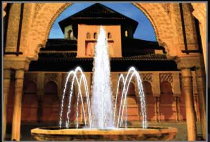
Alhambra - 5m max ht, 8m dia, 10hp