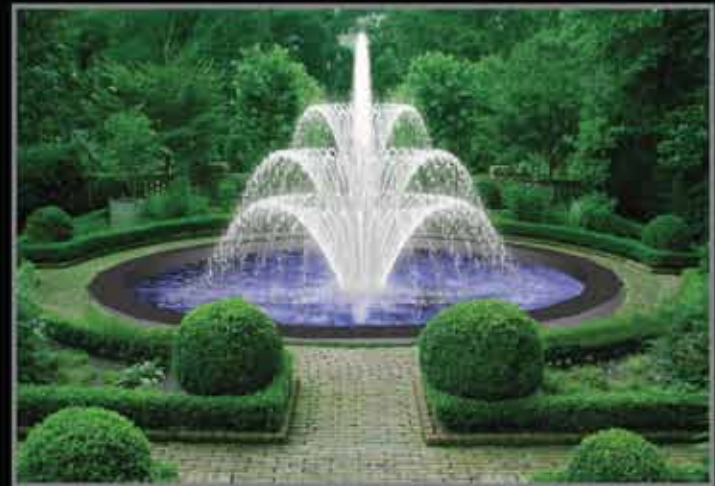
4 Tier Effect Sculpture Fountain - 4.5m ht, 4m dia, 1.5hp