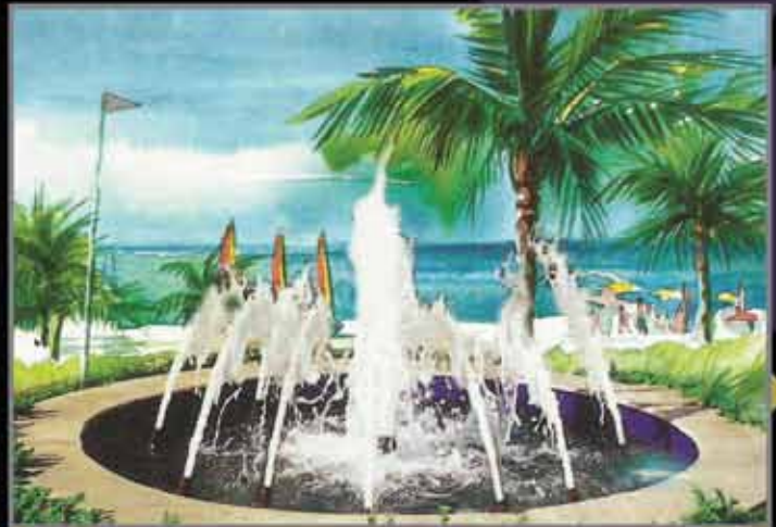
Tortola - 2.2m max ht, 5m dia, 5hp