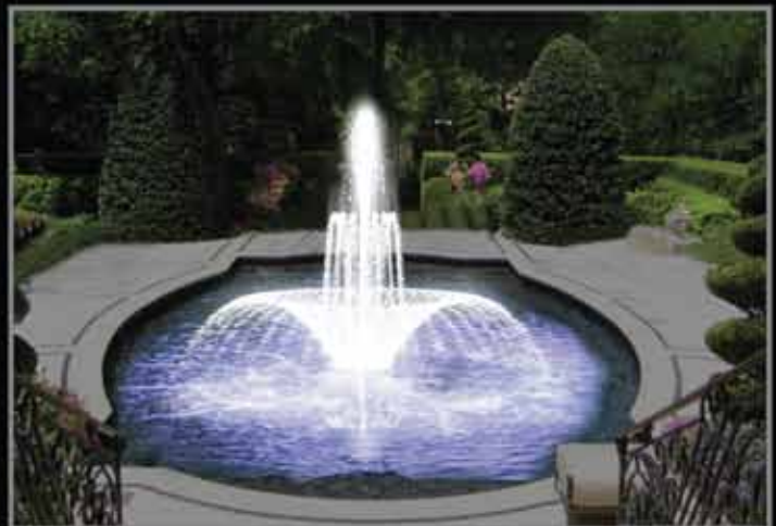
All Effects Together