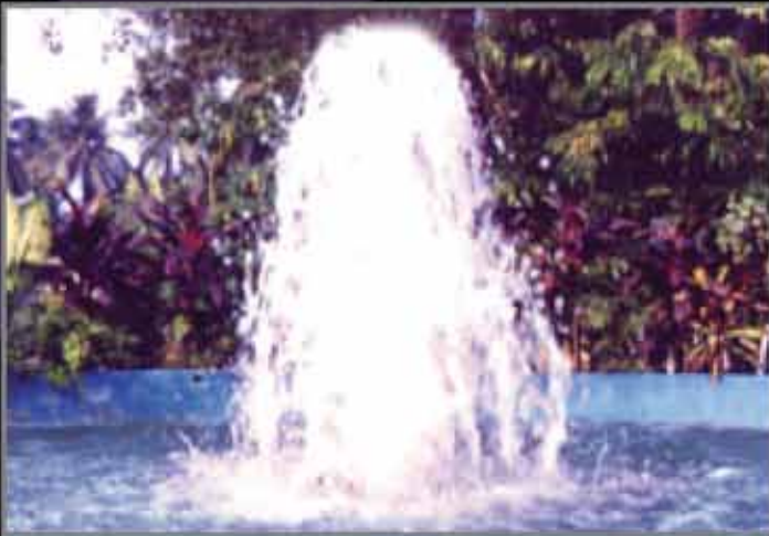
Foam Bubbler - 1m ht, 2.5m dia, 1.5hp