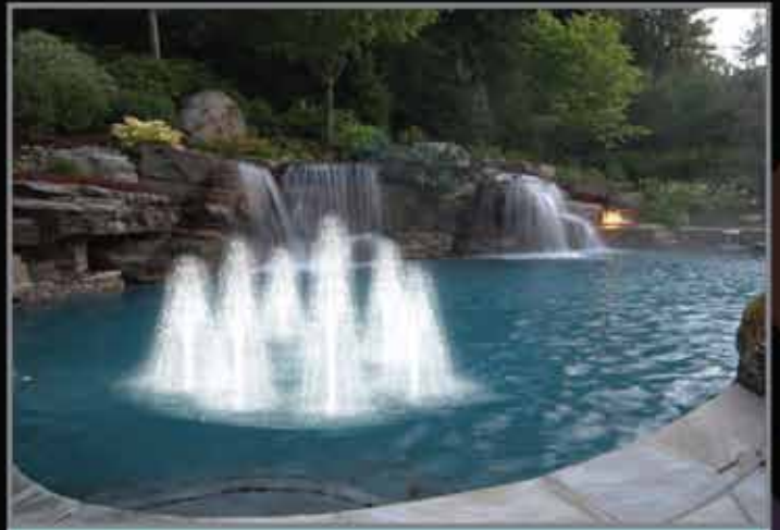
Cascade Jet - 2.5m ht