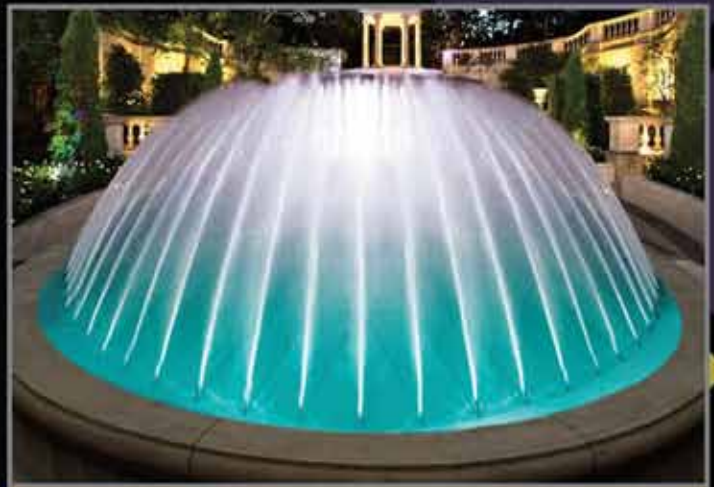
Superdome - 4m ht, 8m dia, 20 hp