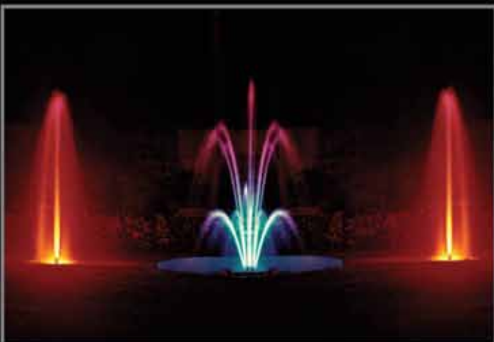
Sculpture Jet with Aerating Jet - 5.6m max ht, 10m x 4m wide, 5hp