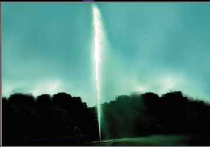
Floating Geneva Jet