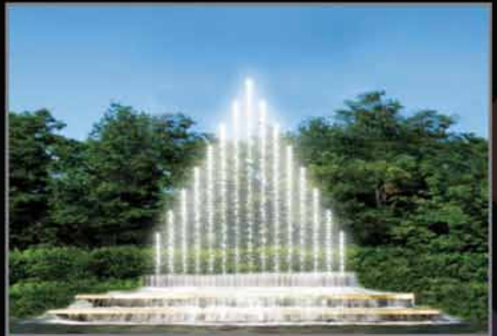
Pyramid - 3m max ht, 6.5 x 3m, 5hp