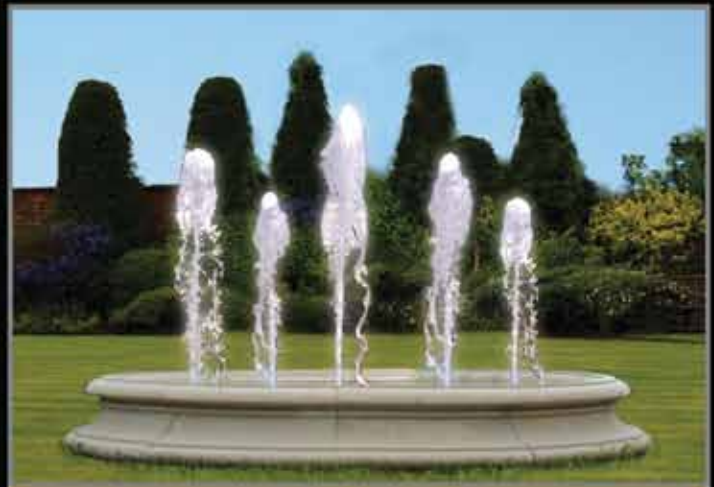
Foam Fantasy - 1.4m max ht, 2.5m dia, 3hp