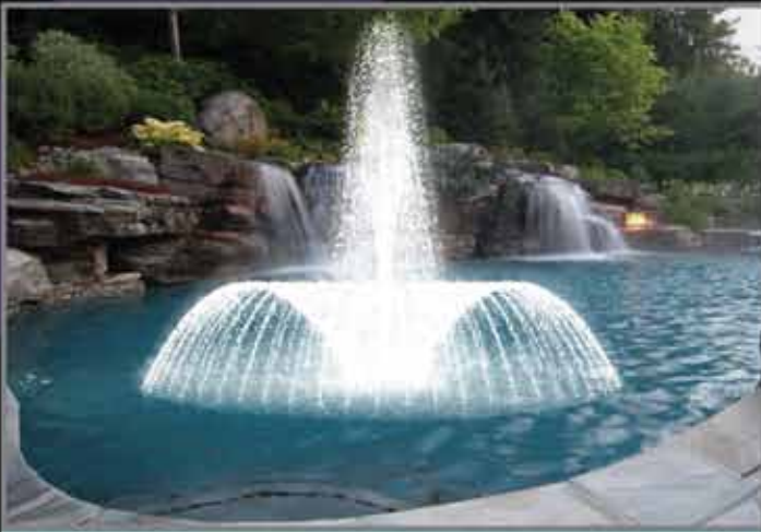
Cascade & Dome