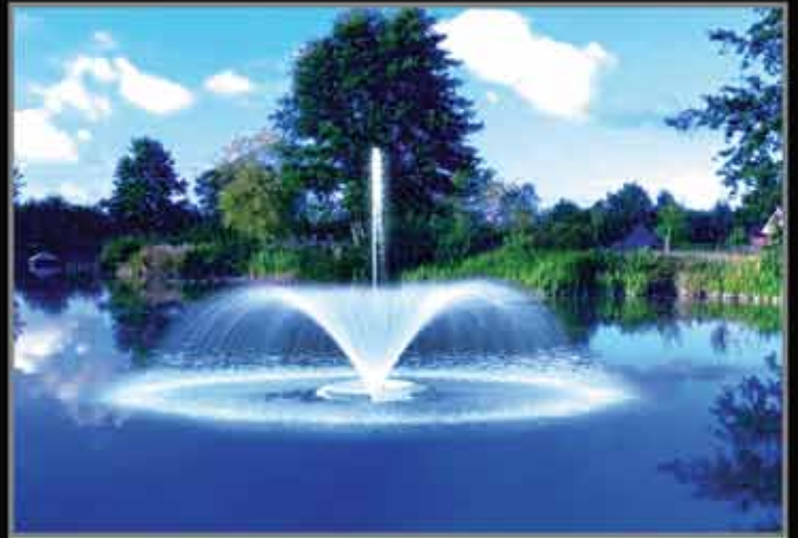
Calyx Aerating - 2.5m max ht, 3hp