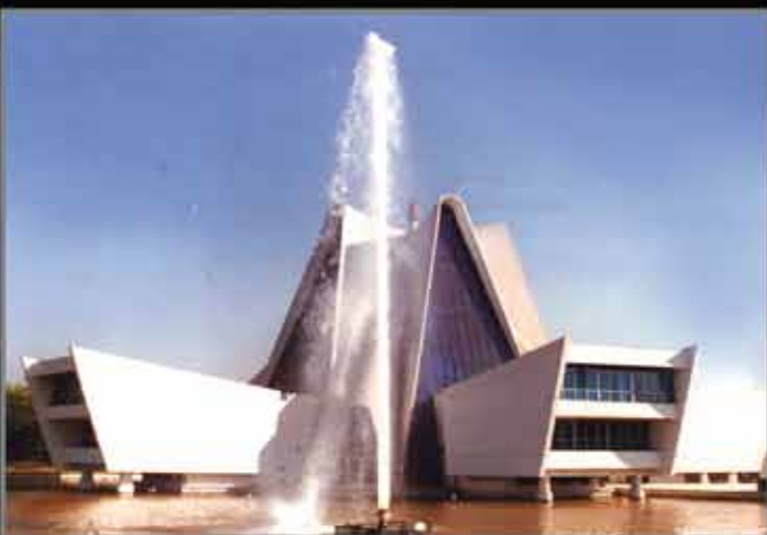
Water Column - 6m ht, 4.6 to 6m dia, 10hp