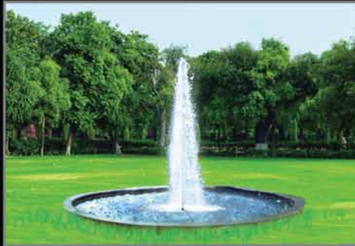
Cascade - 3m ht, 3m dia, 1.5hp