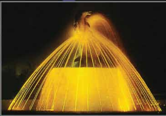
Dome Fountain - 4m ht, 6m dia, 7.5hp