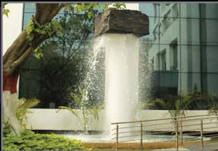
Balancing Rock - 4.7m overall ht, 6m dia, 15hp*