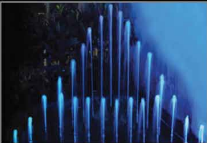
Logo Fountain - 2.4m ht, 9m x 4.5m x 0.9m high, 10hp*