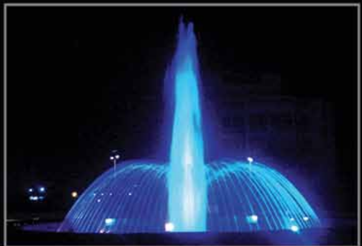
Ring with Aerating Jet - 3.5m max ht, 6m dia, 5hp