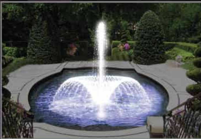
Columnar Outside Drop-1.5m ht