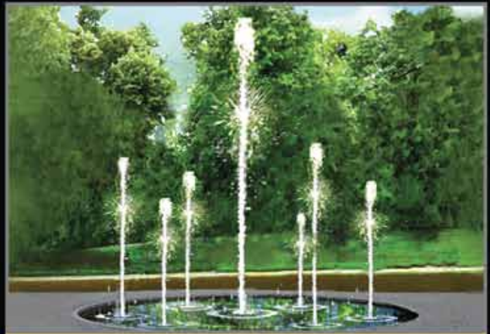
Bursting with Joy - 5.5m max ht, 8m dia, 5hp