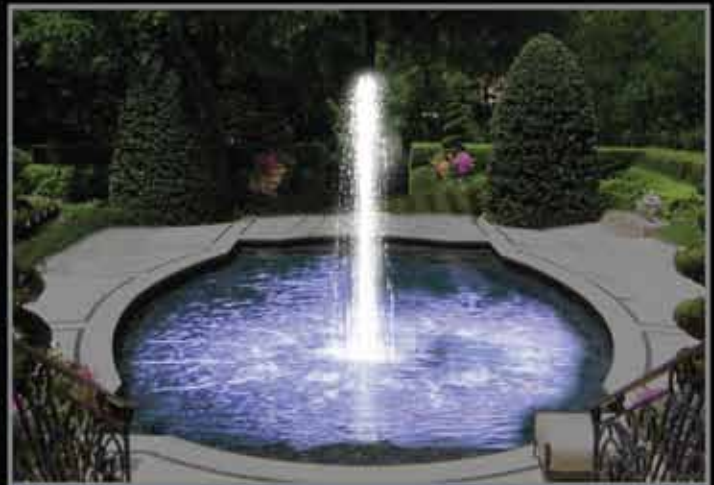
Columnar - 3m ht