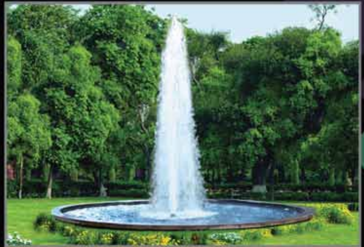
Cascade - 6m ht, 6m dia, 7.5hp