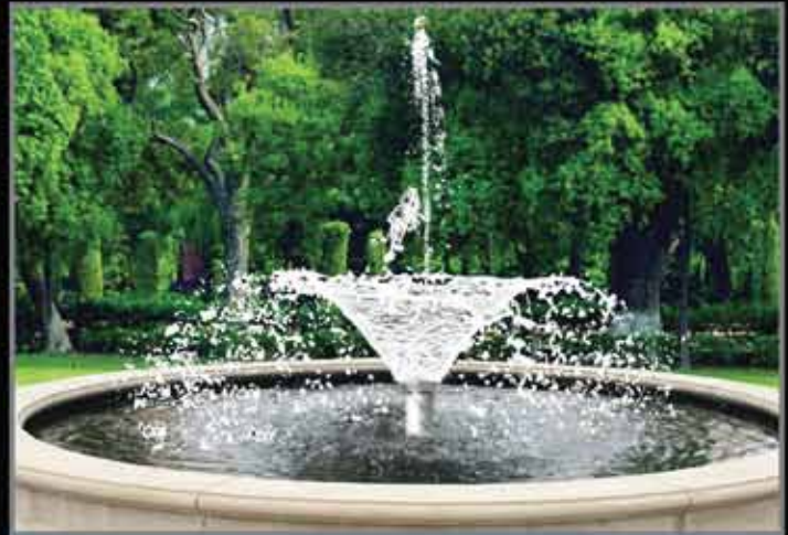
Aerating Calyx & Jet - 0.9m max ht, 2.5m dia, 1hp