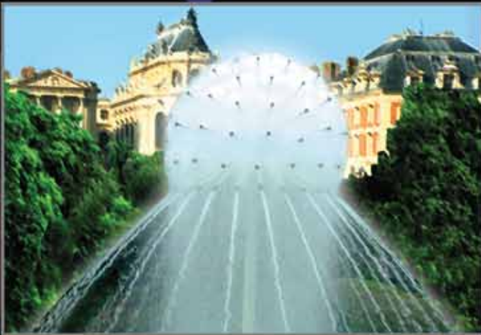
Versailles- 4.3m ht, 8m dia, 10hp