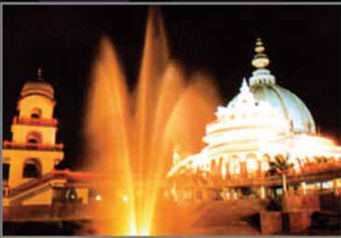
High & Heavy Cascade - 13m ht, 20m dia, 20hp