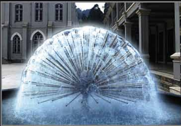
1.75m Half Ball- 2m ht, 6m dia, 5hp