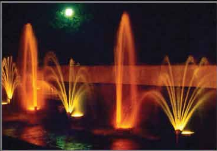
Finger and Columnar Jet - 2.8m max ht, 10m x 1.5m wide, 3hp

10ft. Ball Fountain - 6m ht, 10m dia, 20hp