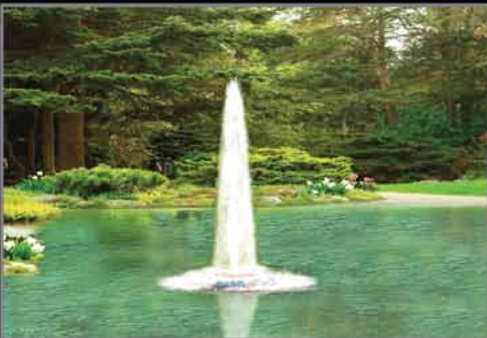
Cascade - 4m ht, 3hp