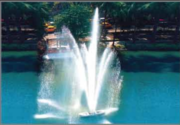
Floating Super Cascade - 20m ht, 40hp